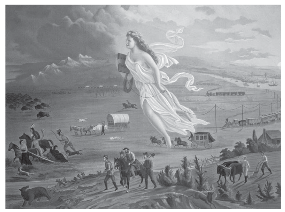
John Gast, American Progress, 1872