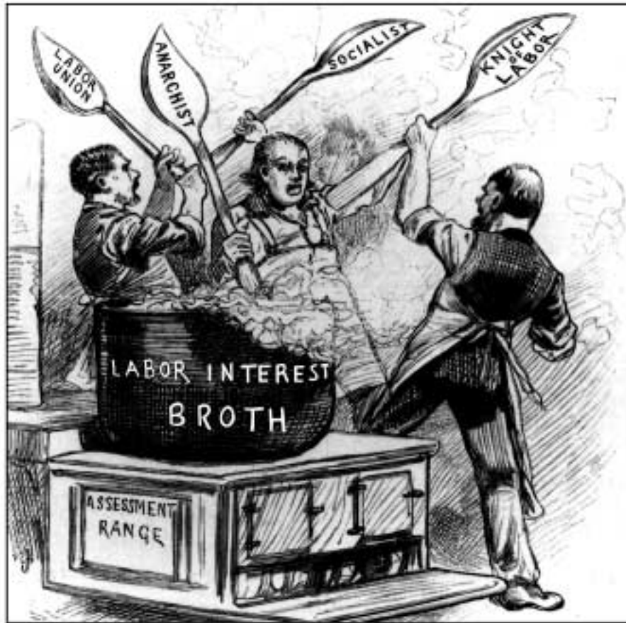
TOO MANY COOKS SPOIL THE BROTH.